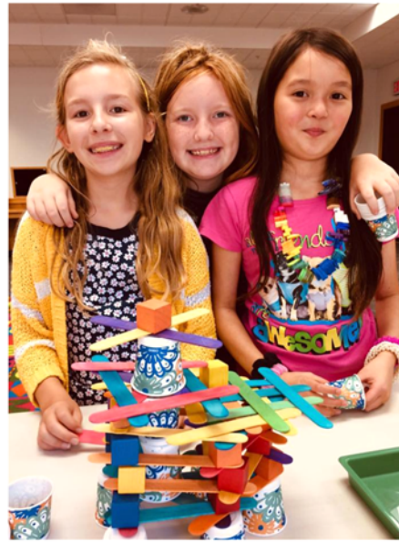
Proud girls with their creation at the Early Release Day "Science Zone" on September 25.