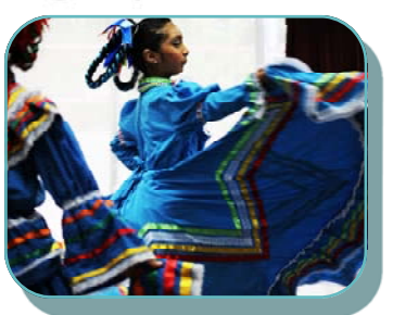
Experience traditional Mexican folk dance with

this free class for kids ages 4 through 12.