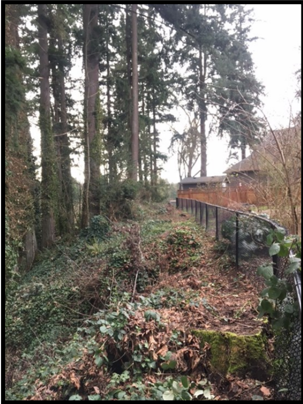
Continued Ivy Removal at Arrowhead Creek Park