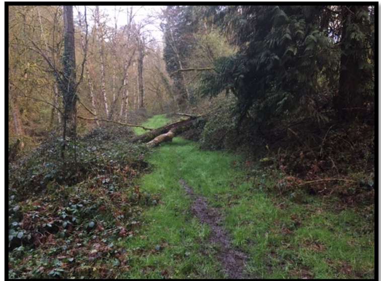
Cleared Boeckman Creek Easement Trail