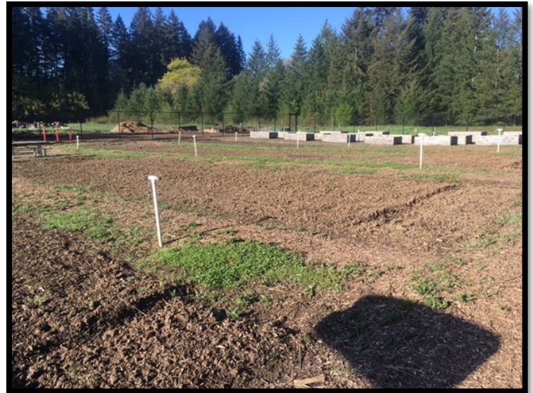
Prepared Community Garden for the season