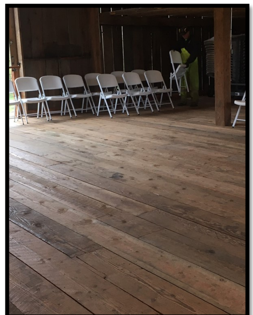
Prepared Stein-Boozier Barn for rental season