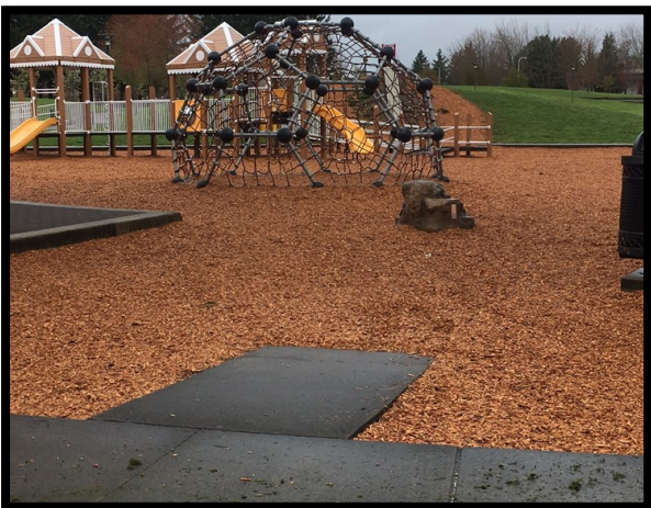
Installed fresh Engineered Wood Fiber at Murase Plaza