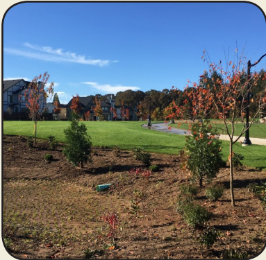
Continued to monitor progress of construction of Trocadero Park (RP5)