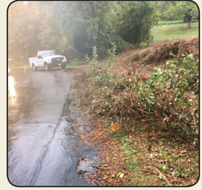
Cleared blackberry and other invasives between Kolbe Lane and Murase Plaza