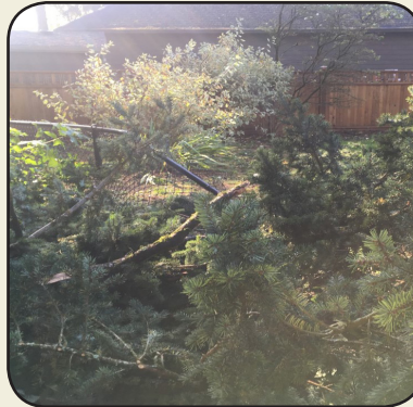
Repaired damaged fence at Water Treatment Plant Park as a result of storm damage