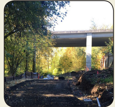
Inspected reconstruction of Boones Ferry Trail