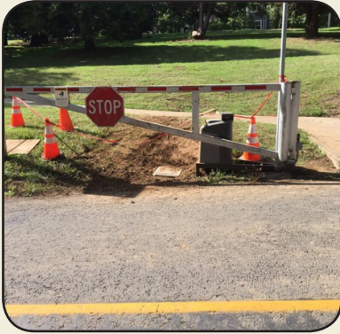
Completed trenching and boring conduit to bring power to Memorial Park