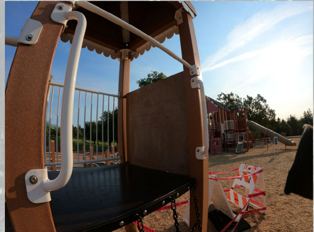
Short Term Fix