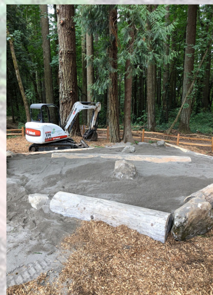
Sand Play Area After