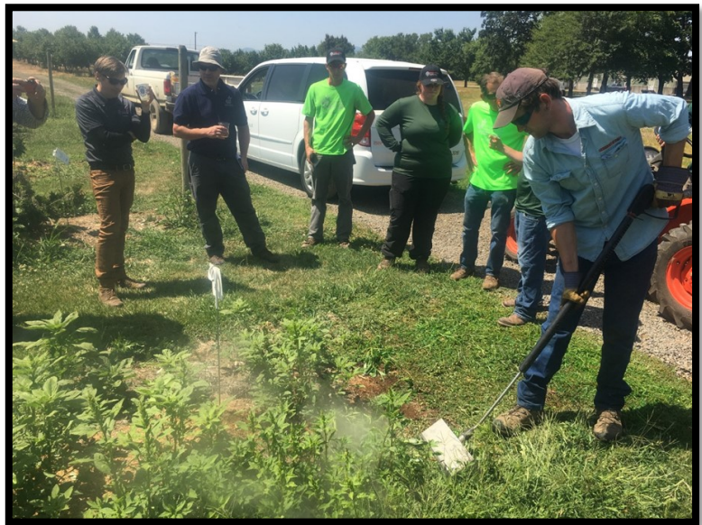
The team gets shown how the weed steamer works