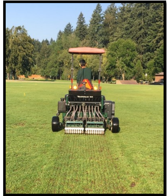
Slit-seeding athletic fields