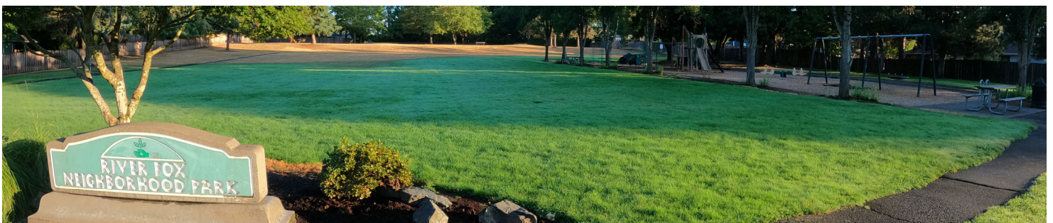
River Fox Park

The City of Wilsonville is funding a capital project this year to replace 21-year-old play equipment at River Fox Park. Modern composite play structures typically feature slides, play panels and other elements that can be mixed and matched. The Parks & Recreation team is conducting public outreach to learn which elements, themes and color schemes are favored by community members. The survey will remain open until October 30.