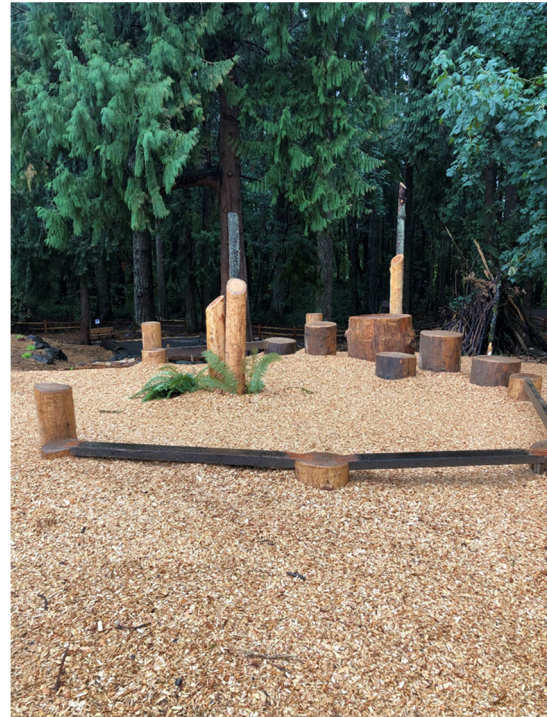
Active Play Area