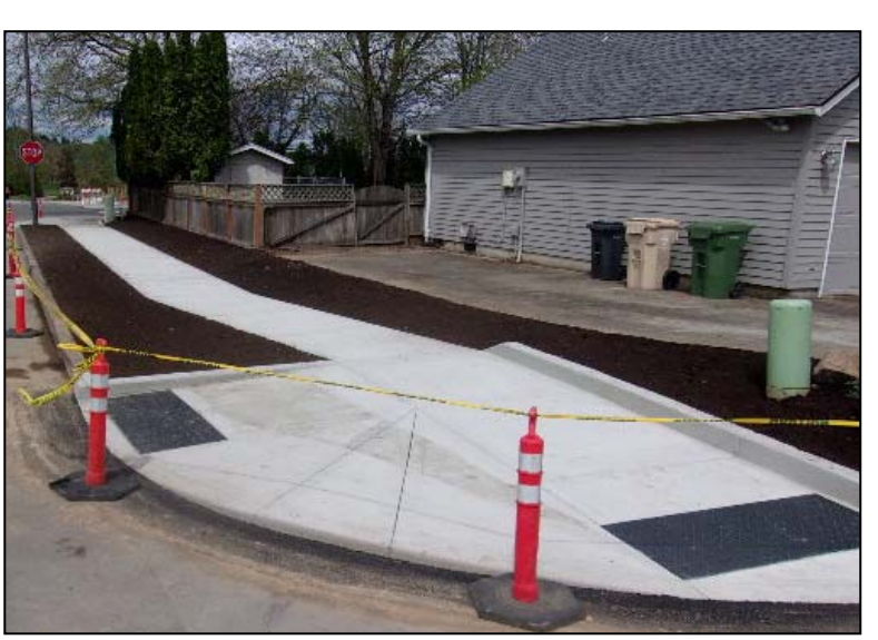
New sidewalk between Jamaica and Wilsonville Road across from Graham Oaks Nature Park.

Greetings! The Planning Division completed two major multi-year long-range planning initiatives this month with the City Council adoption of the Basalt Creek Comprehensive Plan and Transportation System Plan amendments, as well as the adoption of the forward thinking, visionary Town Center Plan. These significant community initiatives lay the groundwork for transformation of the community over the long-term, creating future opportunities for job creation, economic development, and a vibrant city center with year round place making. Both projects were identified as City Council goals. Staff is pleased to be able to finish these two important goals, as the Council goal