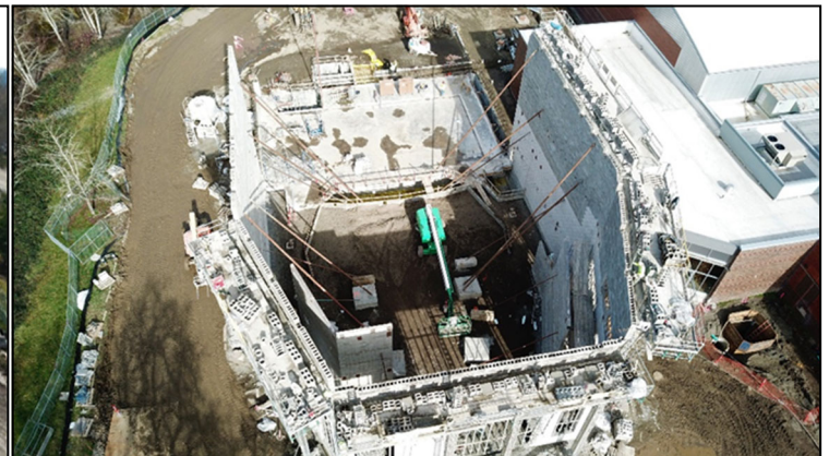
Wilsonville High School Performing Arts Theater Expansion