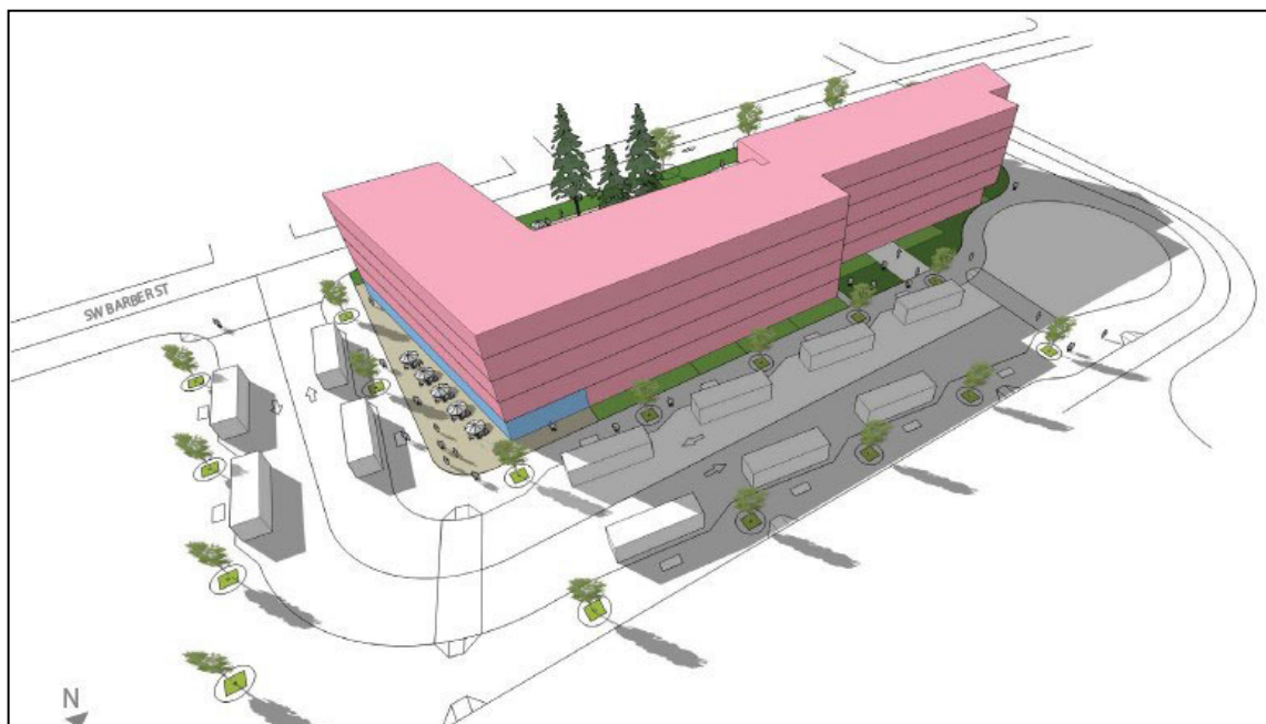
Massing Feasibility Study

https://ci.wilsonville.or.us/economic/page/vertical-housing-development-zones