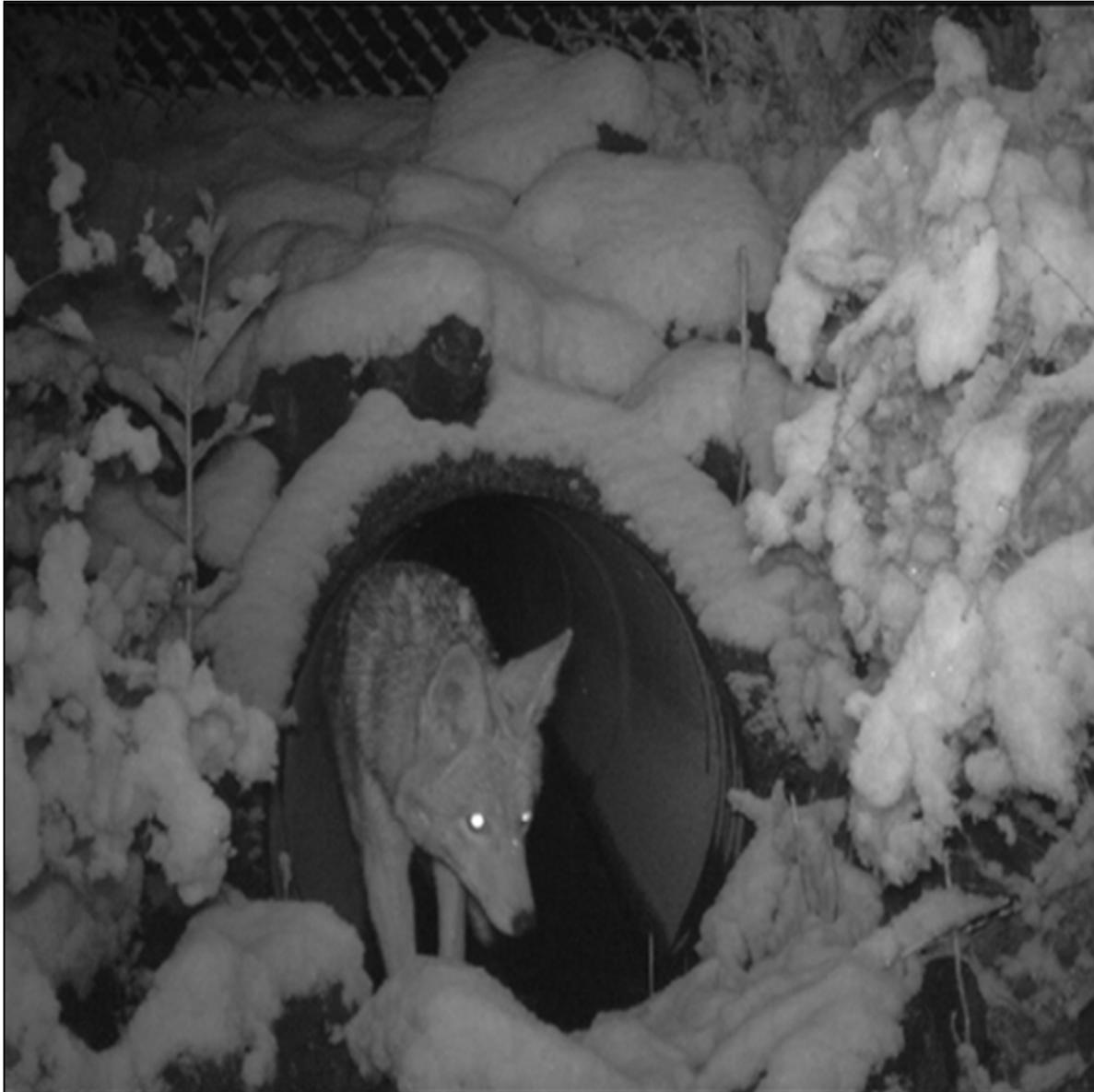
Coyote using a Kinsman Road wildlife passage during 2021 winter snowstorm

In cooperation with Portland State University and a wildlife consultant, the City has been able to document through monitoring the extensive use and effectiveness of the wildlife crossings. To date, more than 20 different species have used the passageways, which include deer, coyote, gray fox, rabbit, raccoon, opossum, skunk, beaver, mink, river otter, short- and long-tailed weasel, rodents, frogs, and snakes.