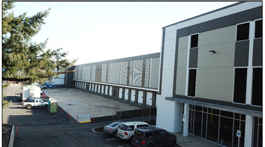
Coffee Creek Logistics Center