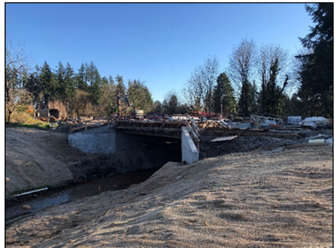
Construction of the 5th Street Bridge

The project involves the design and construction of the extension of 5th Street and Kinsman Road between Boones Ferry Road and Wilsonville Road, including water, sewer, storm, franchise utility extension and installation of a portion of the Ice Age Tonquin Trail. Sewer, storm, and water pipeline installation and overhead utility undergrounding on Boones Ferry Road between Bailey Street and 5th Street is underway. Construction of the 5th Street Bridge over Coffee Creek is underway (pictured). Construction will continue through January 2023.