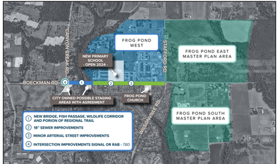
Boeckman Road Corridor Project

This project involves the design and construction of the Boeckman Dip Bridge, Boeckman Road Improvements (Canyon Creek Road – Stafford Road), Canyon Creek Traffic Signal, and Boeckman Road Sanitary Sewer projects. Request for Proposals from qualified progressive design build teams has been advertised with proposals due on March 31, 2022.