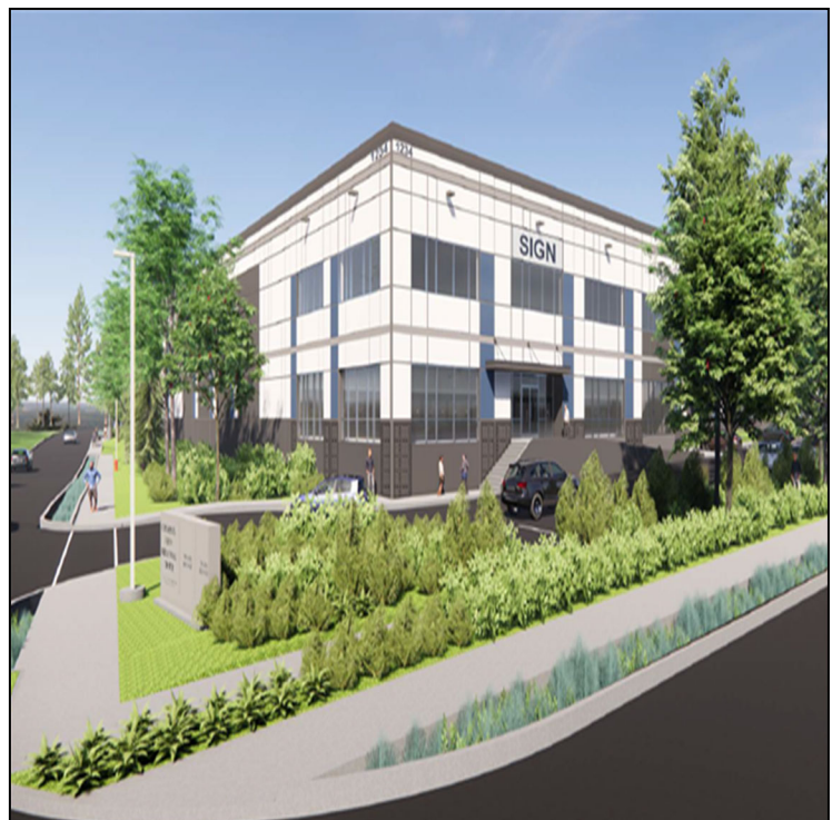
Perspective of Proposed Industrial Building