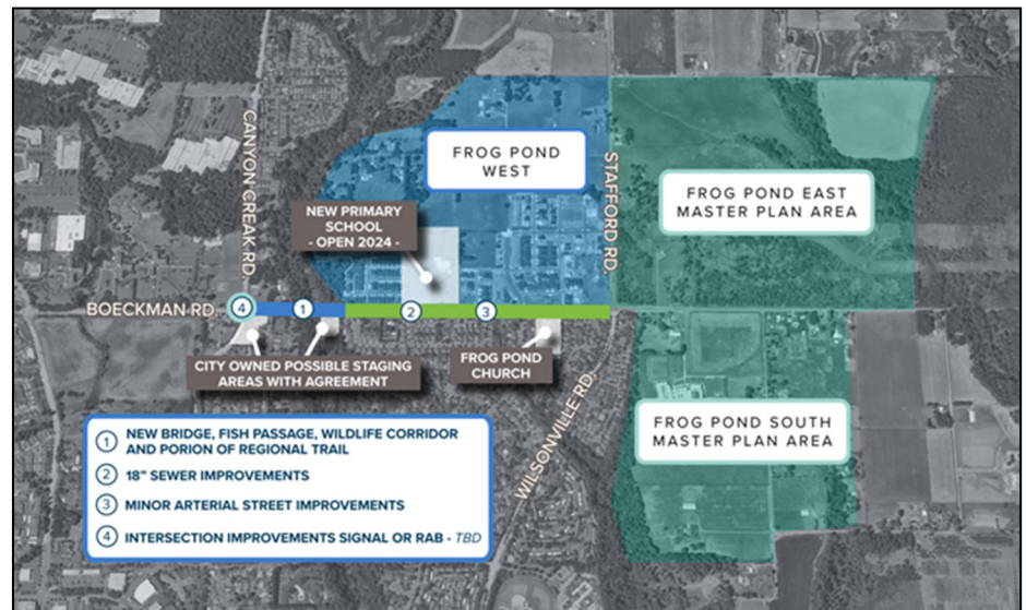
Boeckman Road Corridor Project

This project involves the design and construction of the Boeckman Dip Bridge, Boeckman Road Improvements (Canyon Creek Road – Stafford Road), Canyon Creek Traffic Signal, and Boeckman Road Sanitary Sewer projects. Four proposals from progressive design build teams have been received and are under review. Selection of the most qualified team to design and construct the BRCP is anticipated in May 2022.