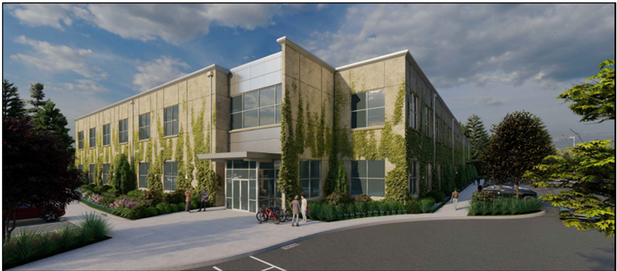
Perspective of Proposed Industrial Building at Kinsman and Boeckman from Boeckman Road