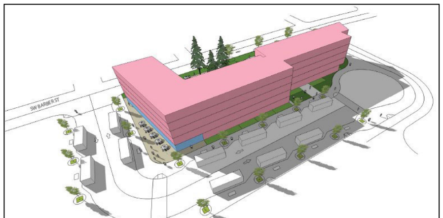
Massing Feasibility Study

The Equitable Housing Strategic Plan identifies creation of tax abatements to create diversity and affordability in the City's housing supply as a near-term implementation action. Additionally, the Town Center Plan identifies exploration of Vertical Housing Development Zones (VHDZ) as a short-term implementation action to encourage mixed-use development. During March, the project team sent notifications of the proposed VHDZ to affected taxing districts and began an evaluation of potential displacement impacts as required by state statute. Adoption of a VHDZ program is scheduled for consideration by City Council on May 2.