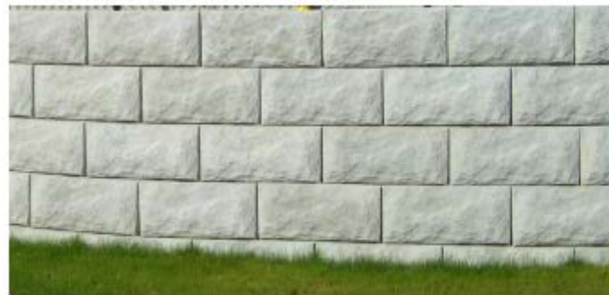
LOCK & LOAD SITE RETAINING WALL (ALTERNATE OPTION TO CAST-IN-PLACE)