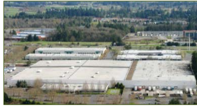
27255 SW 95th Ave URD