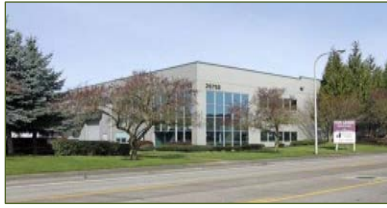
26755 SW 95th Ave URD