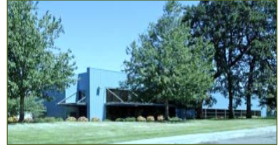
26440 SW Parkway Ave URD