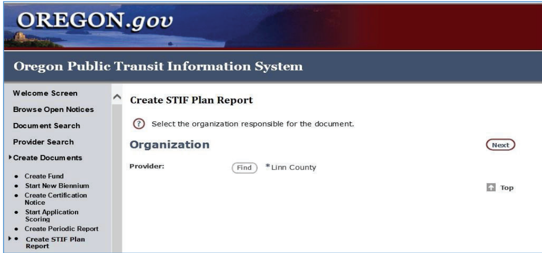
Figure 1. OPTIS Main Menu

A completed SPR will provide an overview of the entire planned STIF Plan budget and remaining funding (see Figure 2).