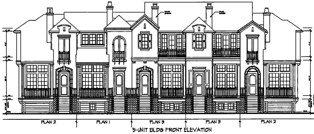
5-UNIT BLDG FRONT ELEVATION