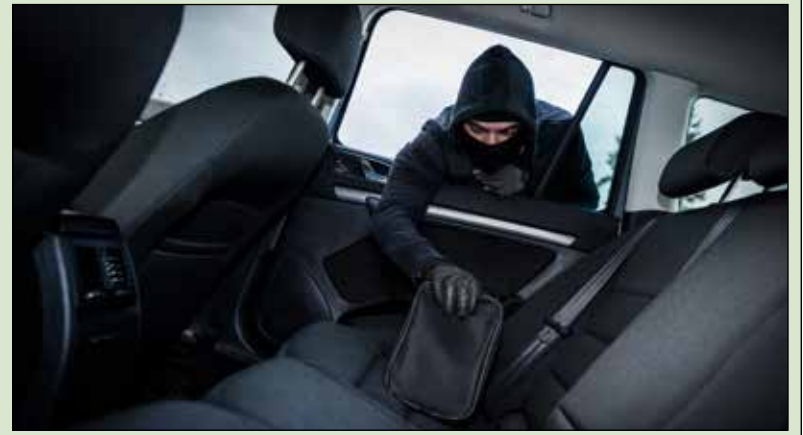
Do not leaving backpacks, gym bags or other similar items visible in cars to tempt would-be car thieves, Wilsonville's police chief cautions.

hidden from view, and less visible to passers-by. • Require a signature to take delivery of packages. If your car is broken into or a package is stolen, report the crime to the Wilsonville Police. For crimes in progress, call 9-1-1; if the break-in has already occurred, contact the police non-emergency dispatch number at 503-655-8211.