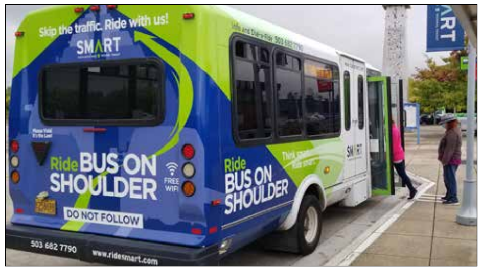
The Bus on Shoulder pilot program is being implemented on 2X routes between the Wilsonville Transit Center and Tualatin Park & Ride.

Brashear is optimistic that the program is here to stay.