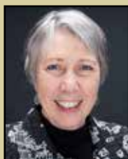
Charlotte Lehan City Councilor