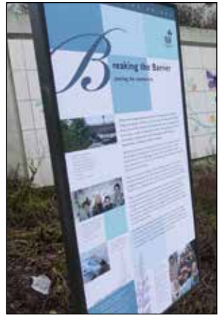
"Beauty and the Bridge" interpretive signs at the I-5 Underpass were funded by the Community Enhancement Program.