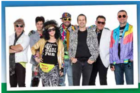
Eighties tribute band Radical Revolution headlines the final show of the 2022 Wilsonville Rotary Concert Series.

Rotary organizers are inviting food vendors (TBA); attendees are welcome to bring their own snacks.