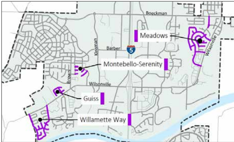
This summer, work is taking place to reseal asphalt surfaces in several Wilsonville neighborhoods.

Barricades and no parking signs will be placed within 36-72 hours of the work. The contractor is