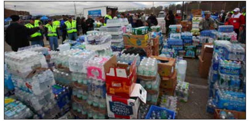
It takes time for drinking water to arrive after disaster strikes. Homes should be prepared to go without tap or bottled water for up to 14 days.

After a strong earthquake, we may need to live without running water and working toilets for weeks or months. When human feces (i.e. poop) is not handled and stored safely, deadly diseases can spread.