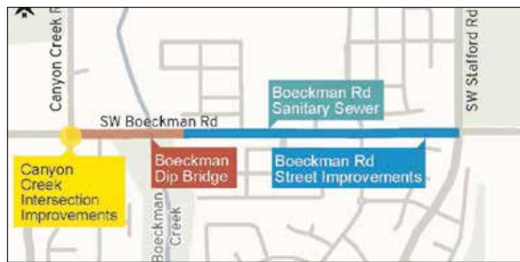
Several projects are getting underway to upgrade Boeckman Rd. to contemporary urban street standards.