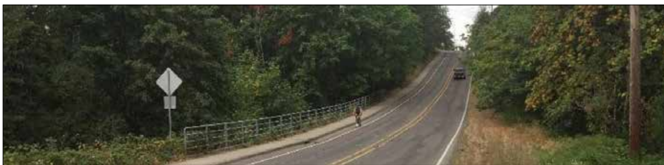
The portion of roadway that includes the “Boeckman Dip” is undergoing several improvements, including a bridge to flatten the curve and provide a throughway for wildlife. The upgraded road will include dedicated bike and pedestrian lanes.