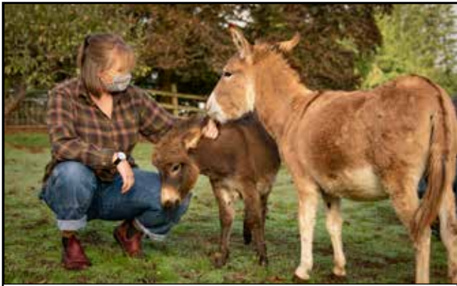
ExploreWilsonville.com features many attractions in the Wilsonville area, including Tollen Farm