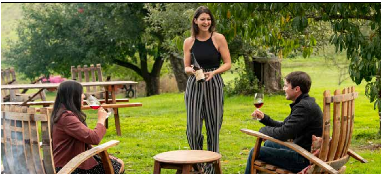
To attract out-of-town visitors, the ExploreWilsonville.com website touts Wilsonville's close proximity to Willamette Valley wineries, including Lady Hill Winery in nearby St. Paul.

Signing up is easy. Visit the Library or sign up at imaginationlibrary.com . Each child registered receives a free book each month until their fifth birthday!