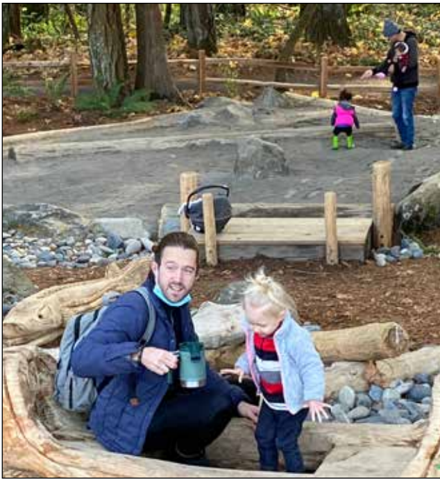
The new nature play area at Memorial Park is among the recent projects developed with funding from the Wilsonville-Metro Community Enhancement Program.