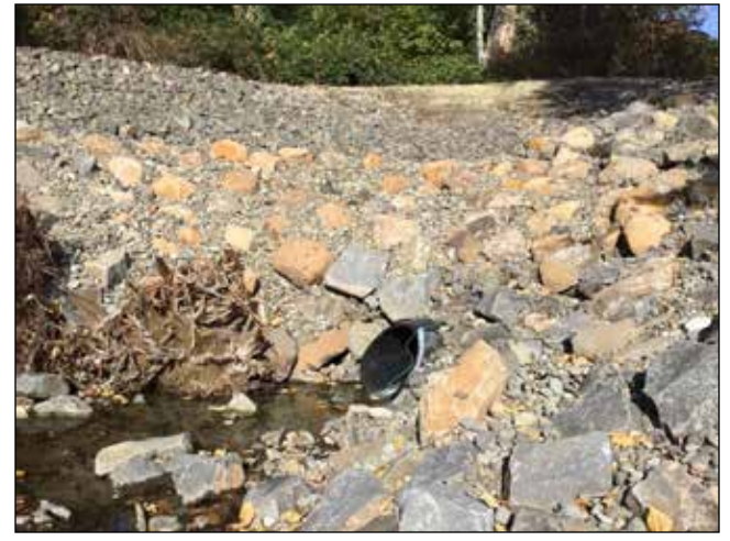
This outfall area at Belnap Court, in the Rivergreen subdivision, is one of two eroding banks repaired and stabilized during a recent capital improvement project.