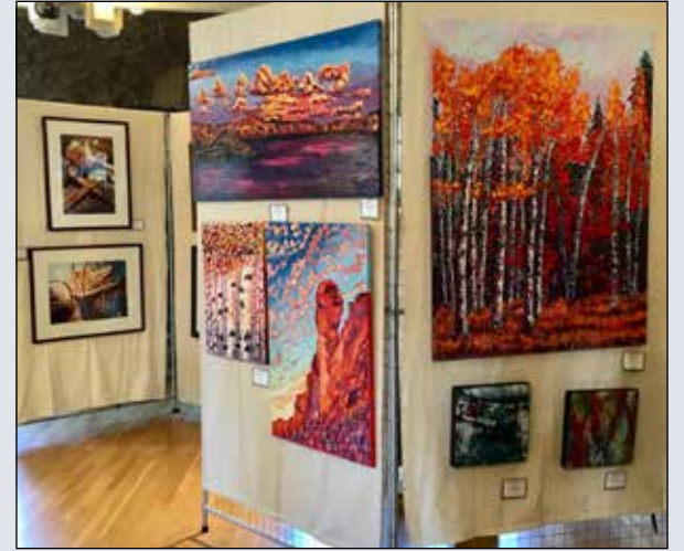
A Community Opportunity Grant is funding the purchase of new gallery displays for the Charbonneau Arts Festival.

WilsonvilleParksandRec.com/GrantPrograms/ .