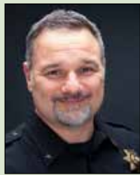
Police Chief Rob Wurpes

Let's start with turning at an intersection. All too often, we see accidents or near misses that are the result of drivers who don't remain in their designated lane at intersections with more than one turn lane. Driving distracted or entering the turn lane at a high rate of speed can cause drivers to drift into the outside lane, which is unpredictable, unsafe and a moving violation. The diagram demonstrates the correct way to take these turns. One way streets are not shown, but the rules are the same.