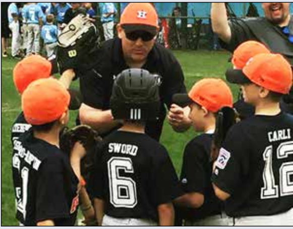
Wilsonville Little League is among recent recipients of the City's Community Opportunity Grant program. A new funding cycle is now underway.

Wilsonville Parks and Recreation is now accepting applications for the Community Opportunity Grant program through Friday, Sept. 27.