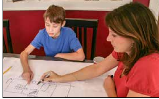
Kids remaining home alone after school should understand basic fire safety, including evacuation plans, how to call 9-1-1 and kitchen rules.