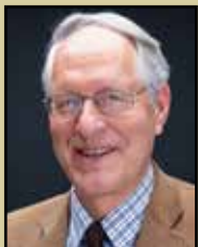
Tim Knapp Mayor

The City Council usually convenes on the first and third Monday of the month at City Hall, with work session generally starting at 5 pm and meeting at 7 pm. Meetings are broadcast live on Comcast/Xfinity Ch. 30 and Frontier Ch. 32 and are replayed periodically. Meetings are also available to stream live or on demand at ci.wilsonville.or.us/WilsonvilleTV . Public comment is welcome at City Council meetings.