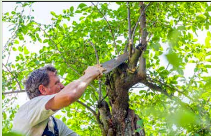
Street tree pruning is required of property owners in order to maintain safety in public right-of-ways.

Regular pruning of street trees improves sidewalk