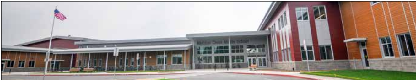
Meridian Creek Middle School was constructed with funds from a capital bond in 2014. A new measure, if approved by voters, would address enrollment growth with several Wilsonville-area projects.

The West Linn-Wilsonville School Board has unanimously approved a resolution authorizing the placement of a $206.8 million capital bond on the November 2019 ballot.