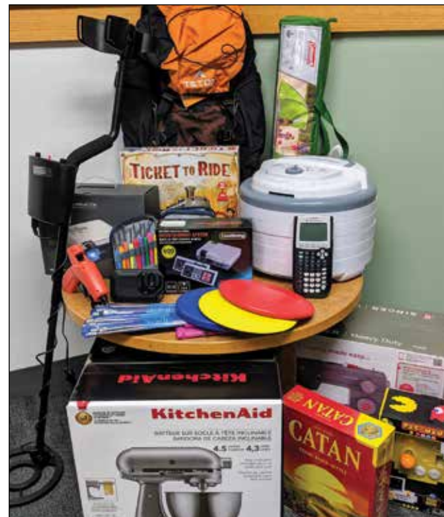
The Wilsonville Library is establishing a new program to make household items like these available for check out.

Visit the library to see what is available or, for more information, visit wilsonvillelibrary.org/lot .